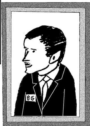
Bully George My Idol

I have a letter that may explain what happened to the Senators. It says that Bully George and Heartless Dick implanted their brains with mind control devices and that Bully George has the remote controls to their brains. The letter contains a copy of the schematics for an implant and corresponding remote control. It also has a list of frequencies and names of Senators. The letter is signed "Anonymous" but the return address reads "Jenna and Barbara, 1600 Pennsylvania Avenue."