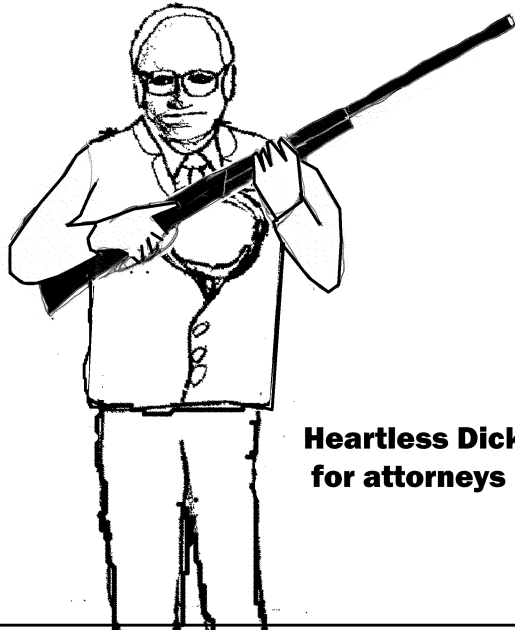
Heartless Dick out gunning for attorneys for attorneys